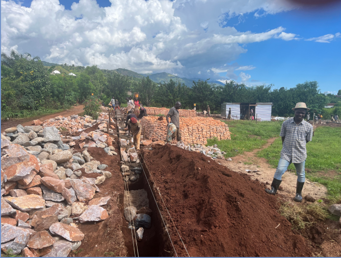
The start of construction