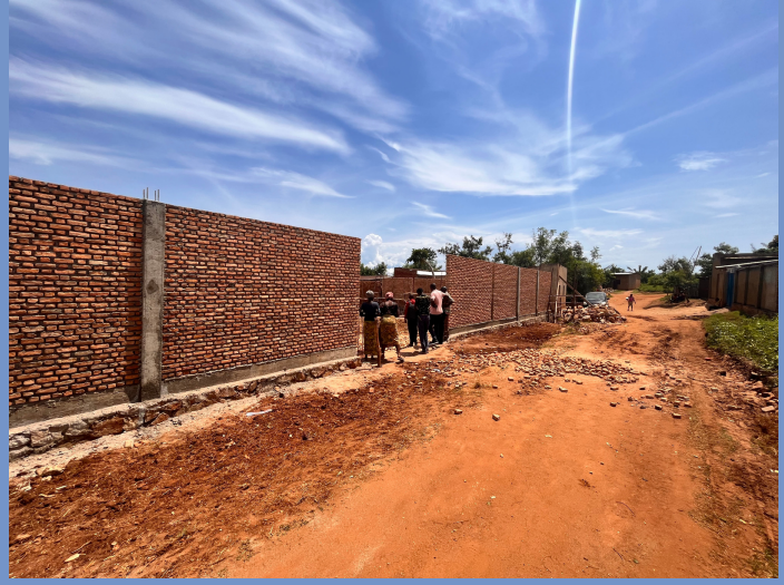
The finished gate